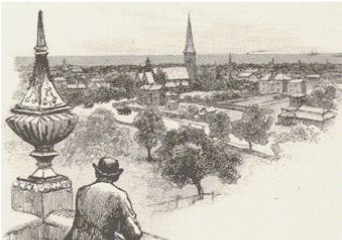
Toorak in the late nineteenth century, looking from Government House towards St. John's.