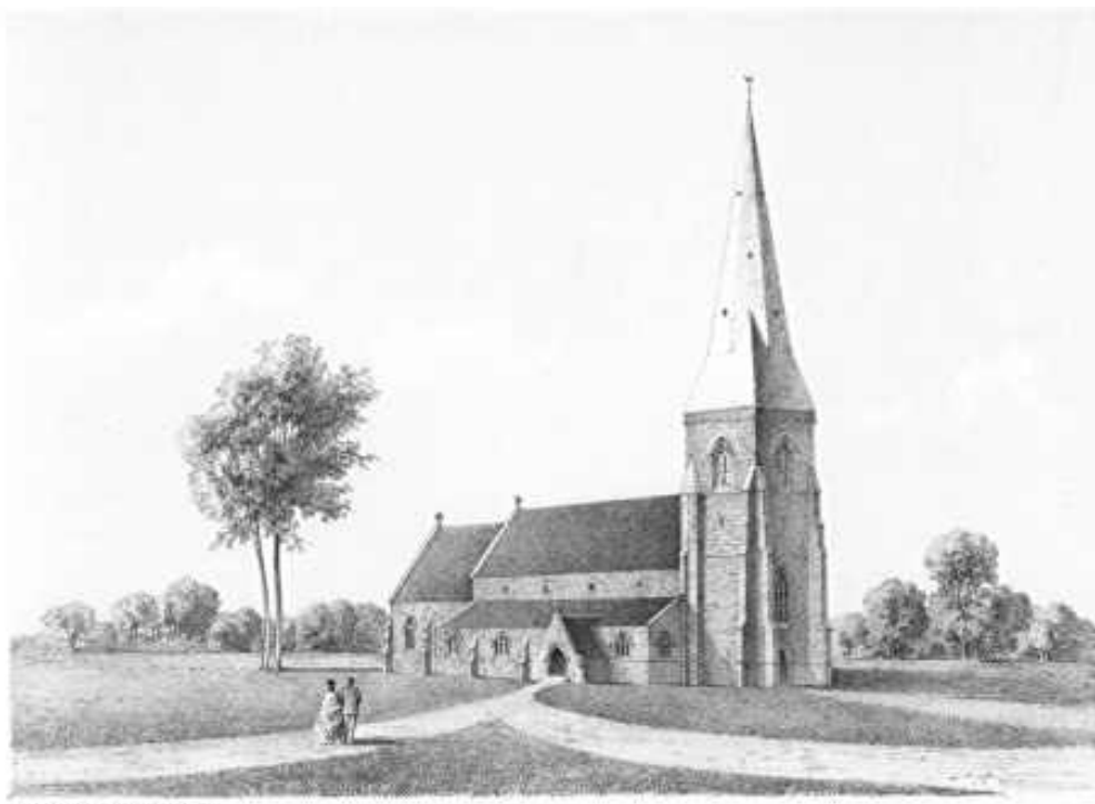
An early lithograph of St. John's church in the 19th century, from the archives at Whitehead's Printers, Clifton Hill.

The Anglican Church of St John the Evangelist 86 Clendon Road, Toorak: Conservation Management Plan. Compiled by Allom Lovell & Associates, Conservation Architects, 35 Little Bourke Street Melbourne, April 2002.