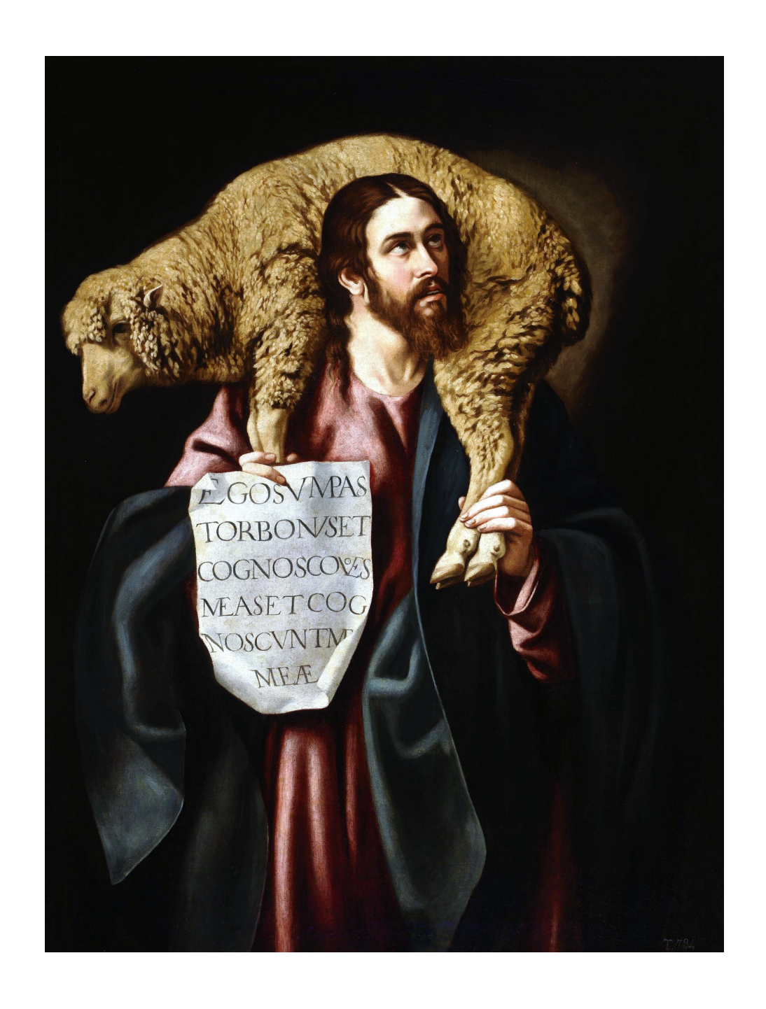
Fourth Sunday of Easter 11 May, 2025 8am